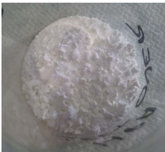
Photos showing the HPA produced