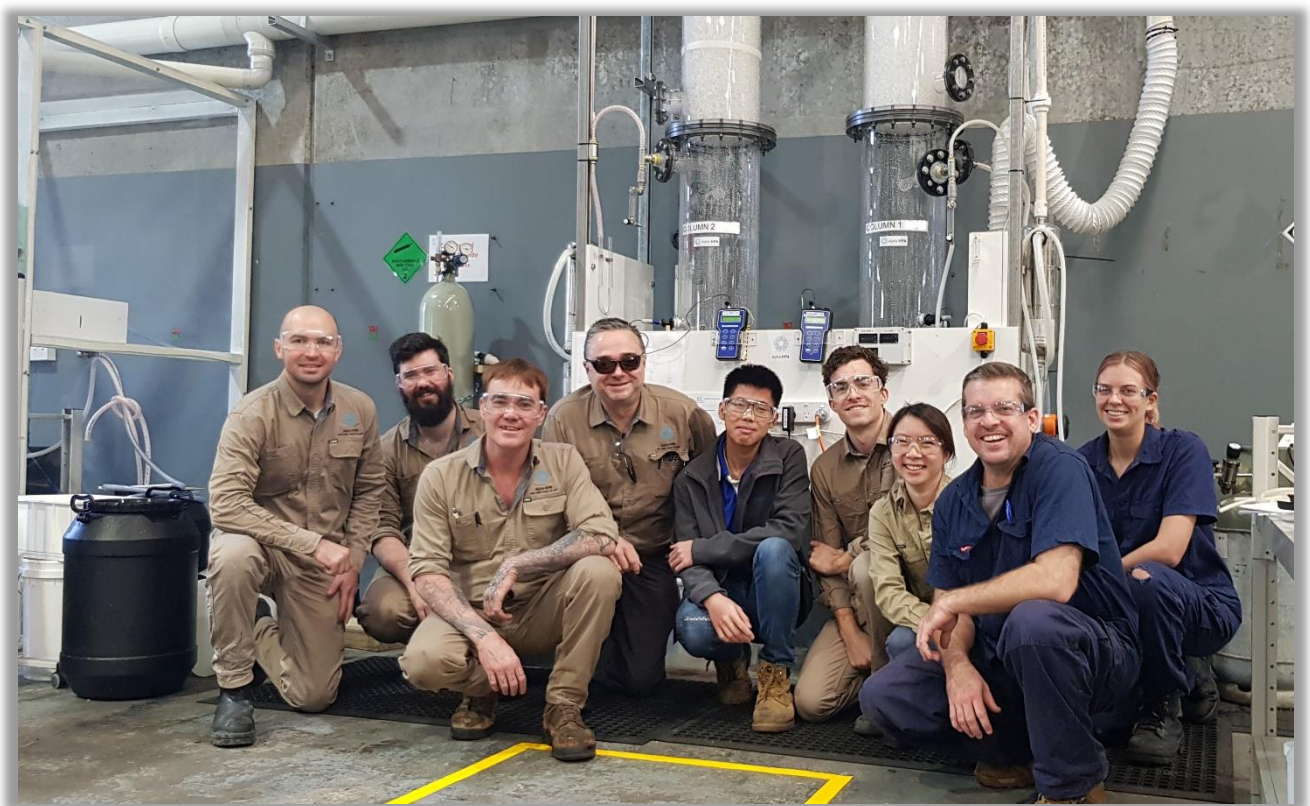
The HPA First Pilot Plant Operations Team

Alpha HPA expects to start distributing commercial scale HPA samples (2-5kg) generated from the Pilot Plant for end-user qualification testwork by August 2019.