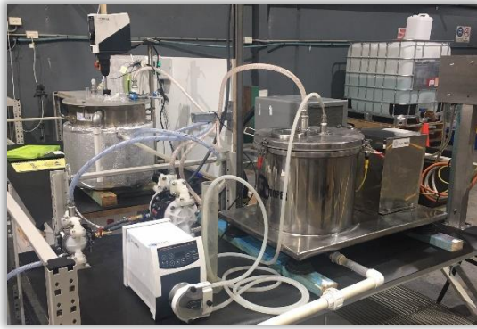
Aluminium Salt Crystallisation Area