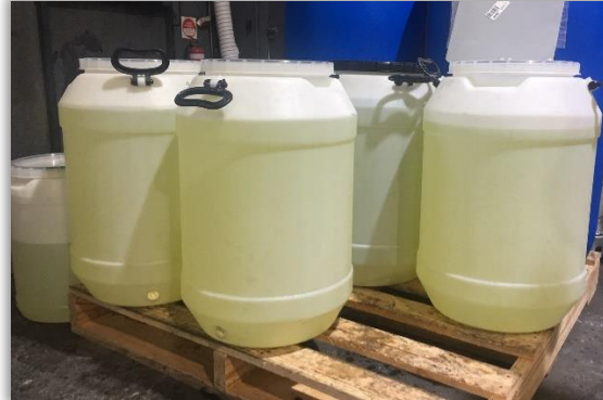
PLS (approx. 60g/L Al) ready for SX extraction