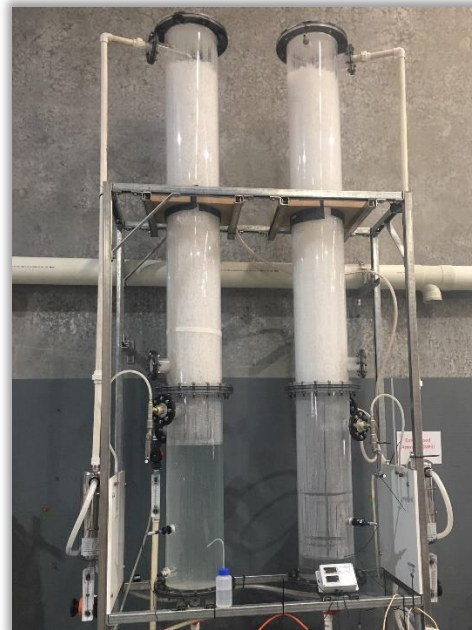
Reagent recycle absorber