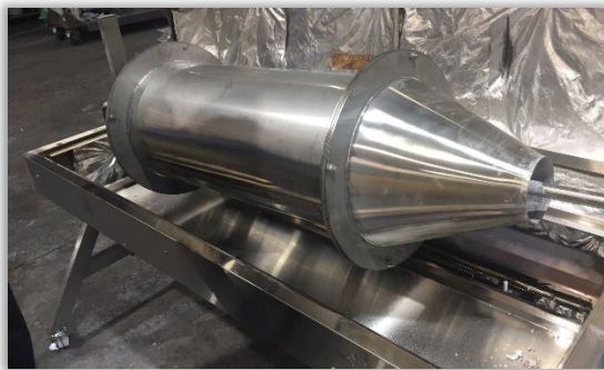
Indirect Rotary Dryer