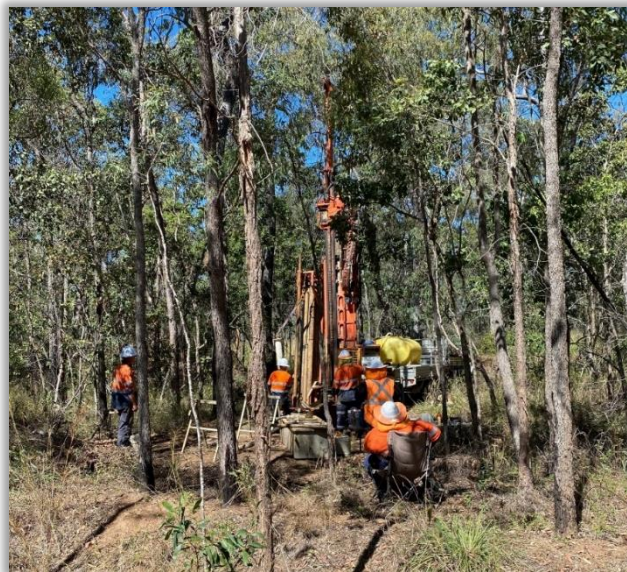
Geotechnical drilling – HPA First Project Site Gladstone

Earthworks design is completed and has been issued to contractors as a Request for Quotation (RFQ).