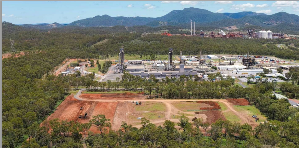
Looking west showing PPF site clearance complete (foreground), Orca (midground) and Rio Tinto Aluminium (background)

Following mobilisation of earthmoving contractors in November, PPF site clearance has now been completed and excavations are underway in preparation for concrete foundations and underground infrastructure (see below).