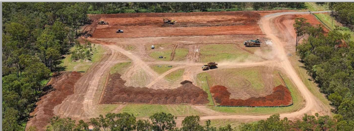
PPF Site – looking south