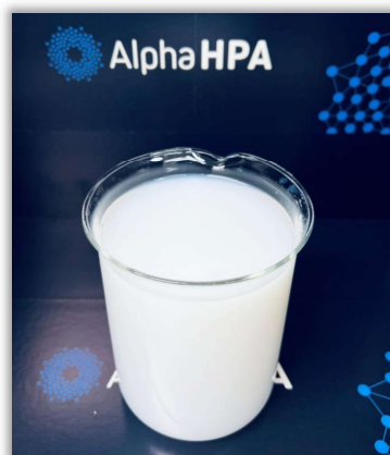
Sol-gel formation from high dispersible boehmite

High dispersible boehmites are used in sol-gel applications in the manufacture of high value, speciality aluminas, including nano-aluminas and alumina for translucent ceramics.