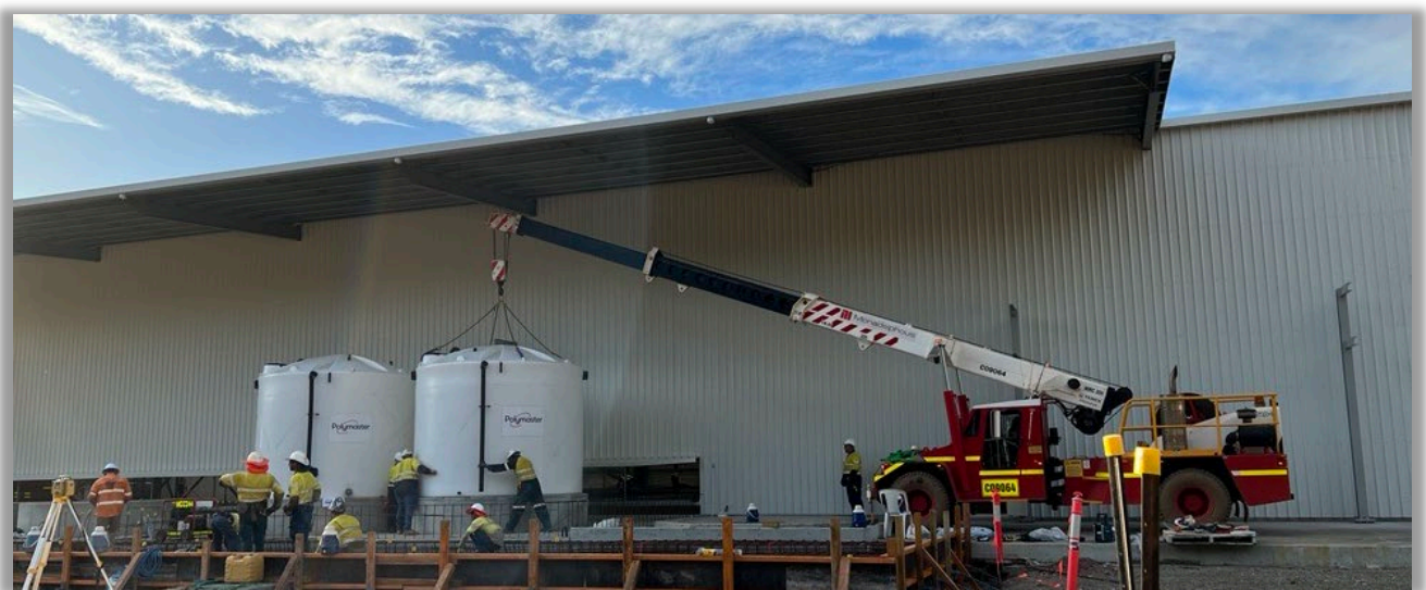
Installation of PPF reagent tanks