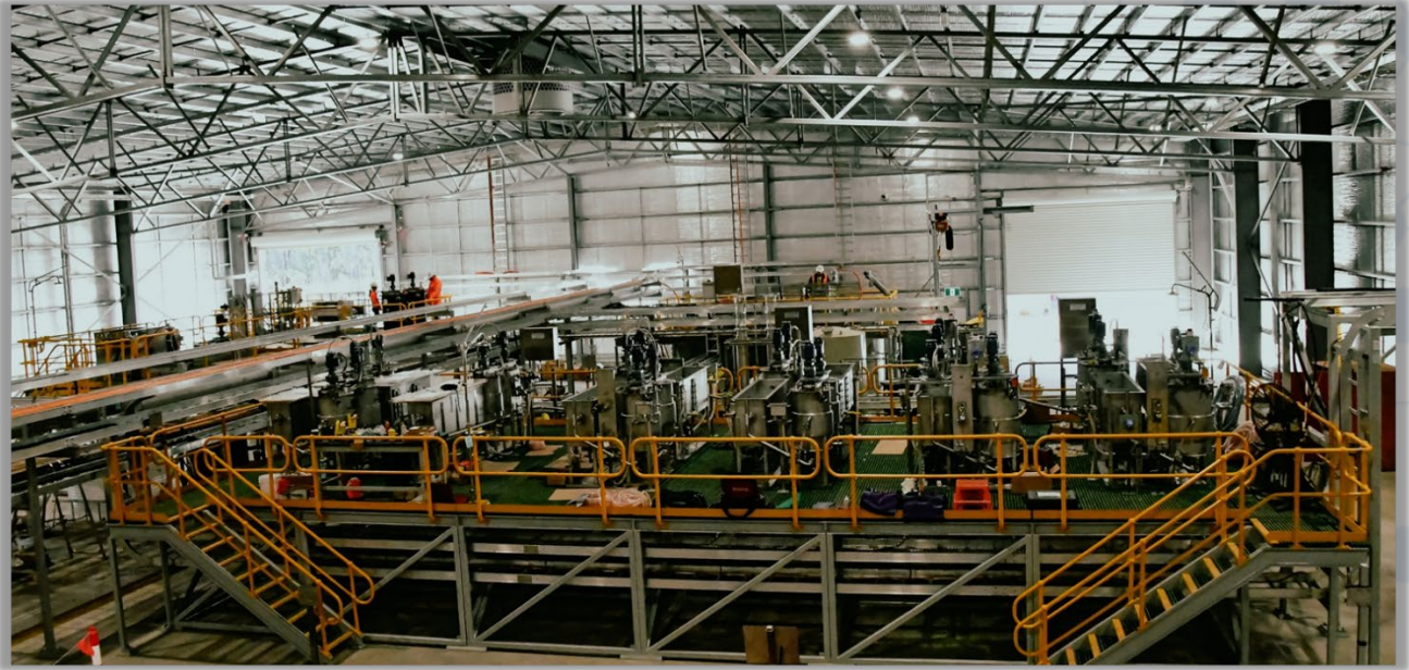
Completed mechanical installation of solvent extraction (SX) circuits