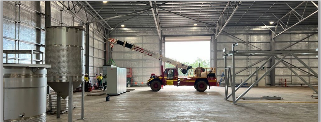
PPF Building Interior - Lighting installed and energised with process equipment deliveries continuing