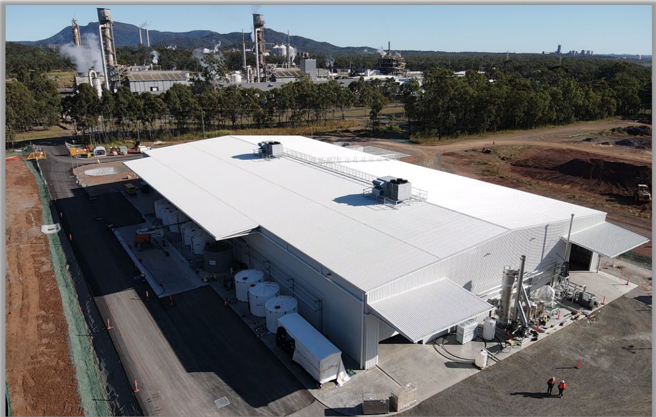
Stage 1 PPF building at lockup stage

The Stage 1 PPF remains on track for commissioning in the September quarter.